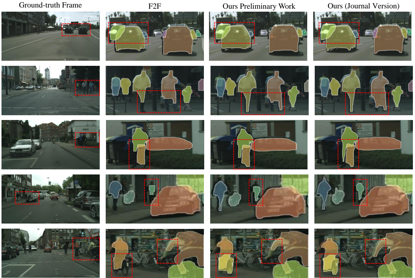
Fig. R.3. Visualized results for the mid-term future instance segmentation prediction.