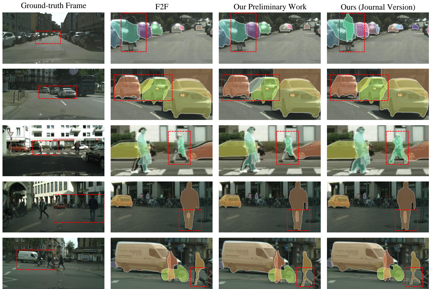
Fig. R.2. Visualized results for the short-term future instance segmentation prediction.